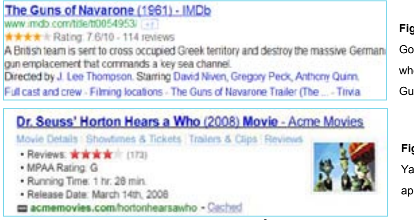
Figure 1.2: Example of Google's Rich Snippets when searching for The Guns of Navarone

For two such examples, we did searches for two movies on the Google and Yahoo! search engines, with returning rich results.