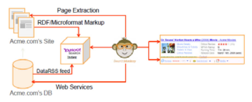
Figure 1.1: How SearchMonkey works

This app encouraged and enabled sites to take control over how Yahoo's search engine presented the results. The solution was based on both markup on the page and a developer plugin, which gave the publishers control over presenting the results to the user. Later, Google announced rich snippets . This supported both Microformats and RDFa markup and enabled webmasters to control how their search results are presented.