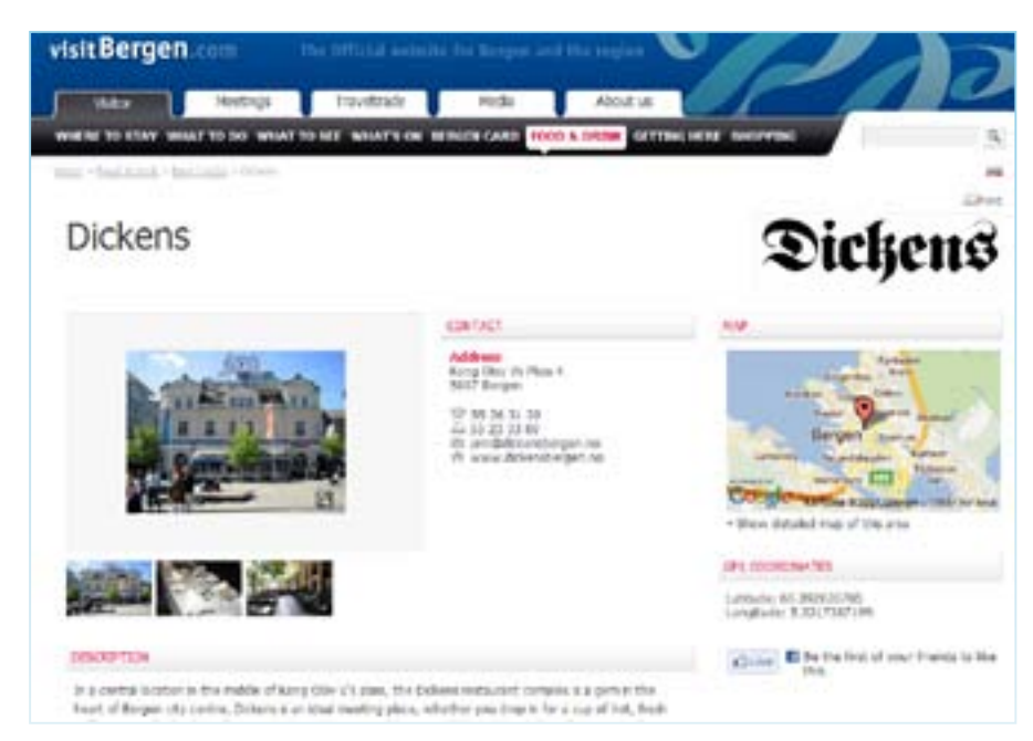
Figure 6.1 Dickens restaurant web page

We will show part of code as an example of using both RDFa attributes and GoodRelations vocabulary on a restaurant web page.